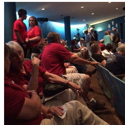
Conference attendees waiting for the Keynote speaker to begin.