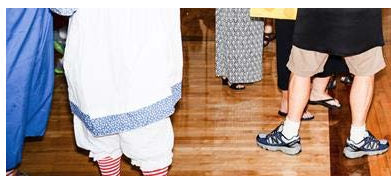
Dancing the night away as famous couples-see anyone you know?